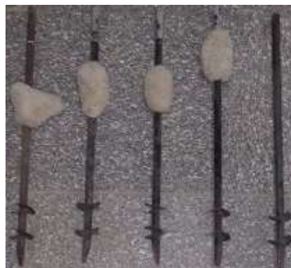
Test set up – for - Uplift capacity of group screw piles with grouted shafts